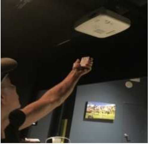
From the front of projector, aim the the remote at the lens and press RED Button 2 times. Green light indicates it's ON

<u>OR</u> If the open screen you find is from a previous Golfer's round, easiest way to be sure the Ball Sensor will be connected is a quick reboot by: pressing simultaneously Ctrl-Alt-Delete keys, SIGN OUT, then Click the Screen when you see the Screensaver, SIGN IN, and Double Click "AG sim". The Golf system will load then follow the Manual.