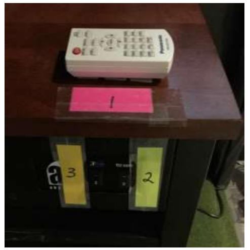
Switches #2 and #3 turn on Ball Sensor, Tee Light and Monitor

For additional assistance: call or text John at (908)-468-7703